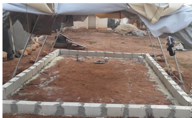
Tent leveling construction activities - (above) Building of the tent base perimeter with mortar blocks, November 2021. (below) Filling of the tent base with aggregate before the final cement layer, November 2021.

As this was the organization's first attempt to implement tent leveling support, a small caseload was identified (120) to ensure that improvements could be verified in all areas (e.g., camp and household identification, procurement, construction, and participant engagement) before committing to a larger scale intervention.