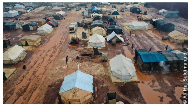
Aerial image of a camp in Idlib devastated by the heavy floods, forcing many families to leave their homes during the night and take shelter elsewhere.