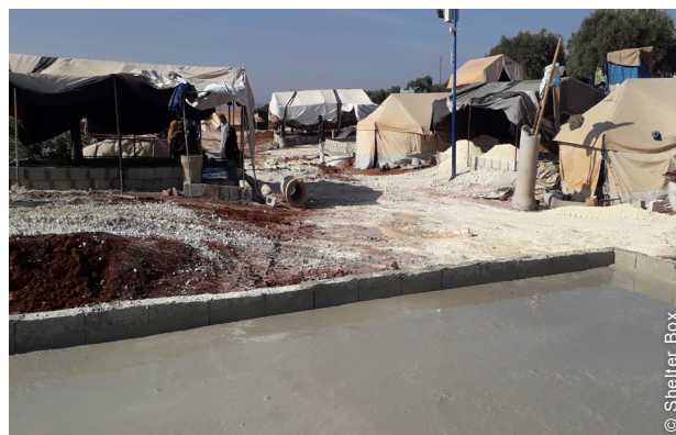
Cementing of the tent bases, November 2021. Size of the different tents were measured, and the tent bases were constructed according to the tent sizes.