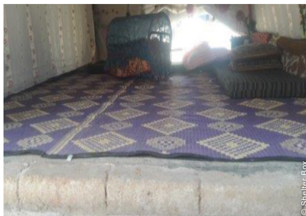
Interior view of a tent after the construction of the tent base.

The in-country partner engaged a civil-works contractor through a competitive procurement process, contracting out the tent base construction package. Once the team had conducted due diligence checks and was satisfied with the civil works contractor's policies and processes, responsibility for the following elements was passed on to the contractor: procurement of materials (cement blocks, gravel, and cement), transportation of the materials to the installation site and the labor required for the construction of tent bases. Contractor work was overseen by the in-country team and a construction foreman, ensuring it was delivered according to the agreed-upon specifications, timeframes, and quality.