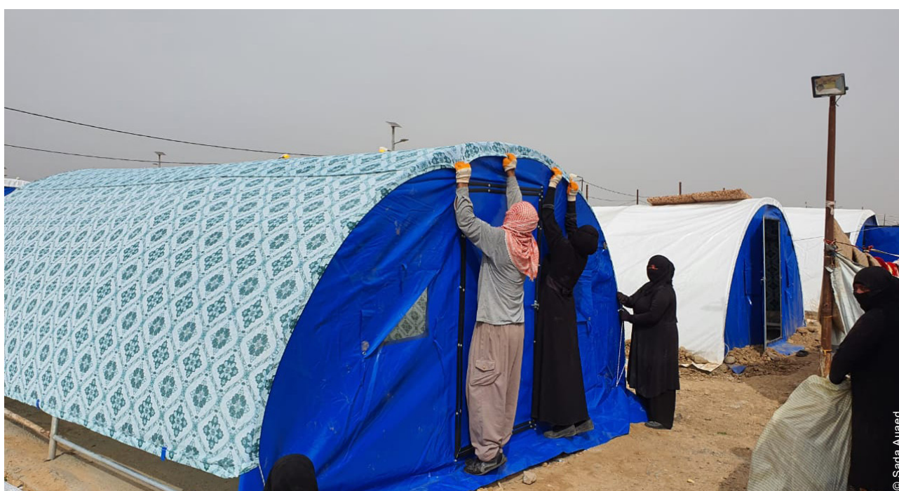
1000 women from vulnerable households were given technical training to take part in the maintenance and repair of tents, September 2019.

Upon the area's liberation from ISIS in late 2017, the government decided to close many of the camps in different governorates. However, the Jeddah ones remained