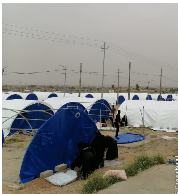
New tents were installed with the support of the female participants of the project, September 2019.