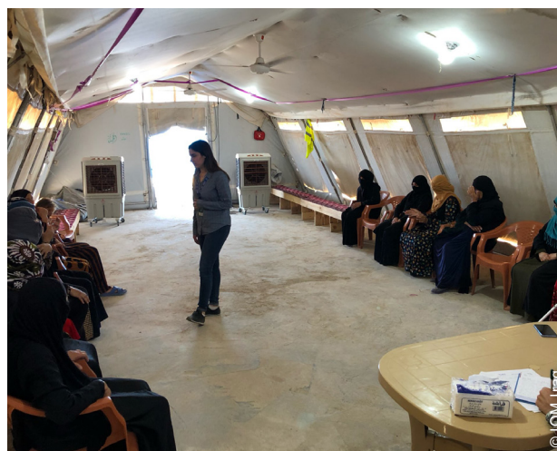
Focus Group Discussions were held with the female-headed households to engage them in the tent repair work, which would generate livelihoods opportunities for them.