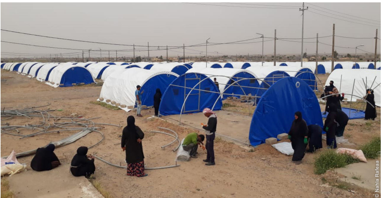
(Above) Women filling the bags with sand. (Below) Many of the participants also gained experience in the field of electrical repair and other technical works through the project.