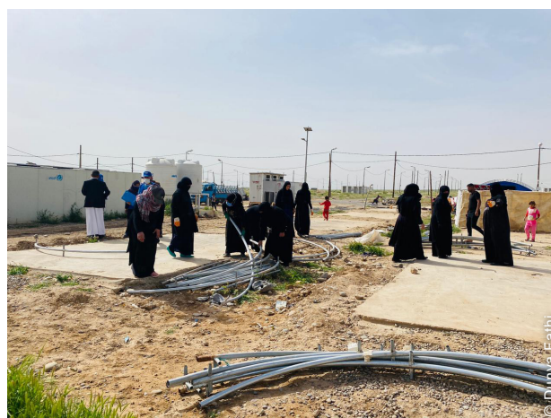
The groups of women took charge of additional tasks, such as loading of the tent parts, arranging the steel frames, lifting the tents, and storing the used tents.