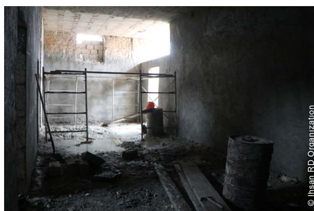
22 collective centers were upgraded as part of the project. Upgrades prioritized reducing protection risks and improving health conditions.