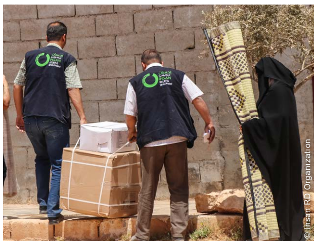
The organization worked with local Implementing Partners (IPs) in all parts of the project including for the distribution of NFIs.

The shelter activities were part of a multi-sector program which was consortia led, covering shelter, WASH, protection and health. The overall program was guided by the health interventions as they were the primary activity. Supporting health centers and hospitals provided an entry point into communities, and shelter and WASH rehabilitations were done in the same areas where the project was supporting these health services. Technical assessments of housing and collective center's also prioritized health and protection risks.