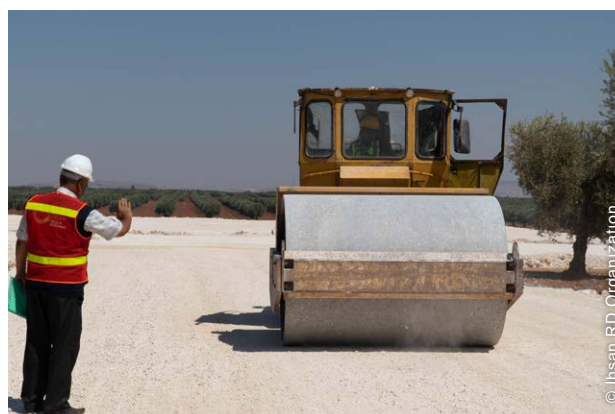
Site improvements at IDP sites included improving accessibility and reducing flood risk.