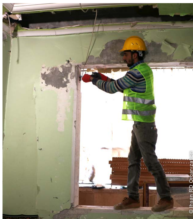
Upgrades of building elements such as doors and windows to ensure that buildings were better sealed off greatly improved winterization and protection.

High satisfaction levels were reported from families, especially those in rehabilitated collective centers and housing units of which 82% of respondents from a 123 household sample said that the works were of a high standard. Meeting emergency shelter needs provided a foundation from which they could start to rebuild their lives.