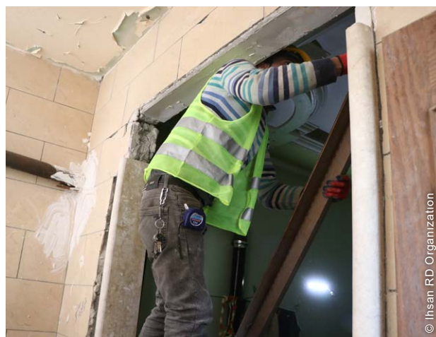
Housing rehabilitation was one of a range of interventions designed to support the different shelter needs of different households.