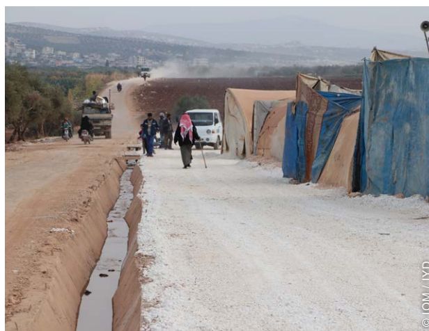
There are over 1,000 IDP sites in Northwest Syria, with most of them clustered close to the Turkish border.