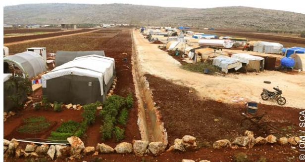
After: An informal camp, post-flood mitigation intervention.