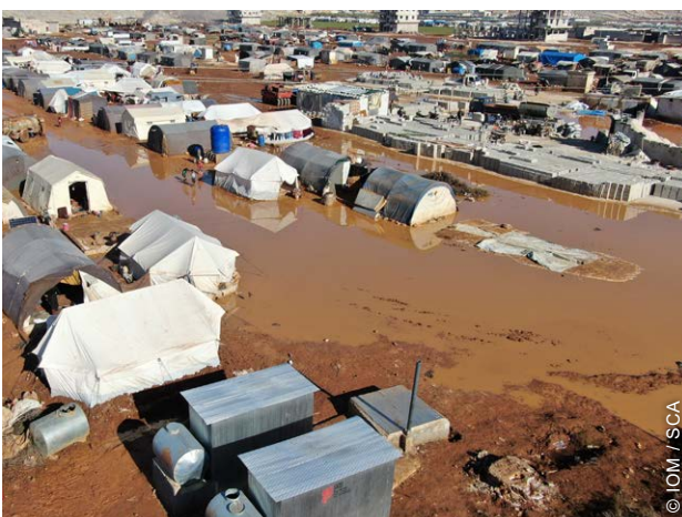
Many self-settled IDP sites have been built in low-lying areas that are at risk from seasonal flooding.

Due to access constraints, the project was managed remotely by the organization from Gaziantep, Turkey.