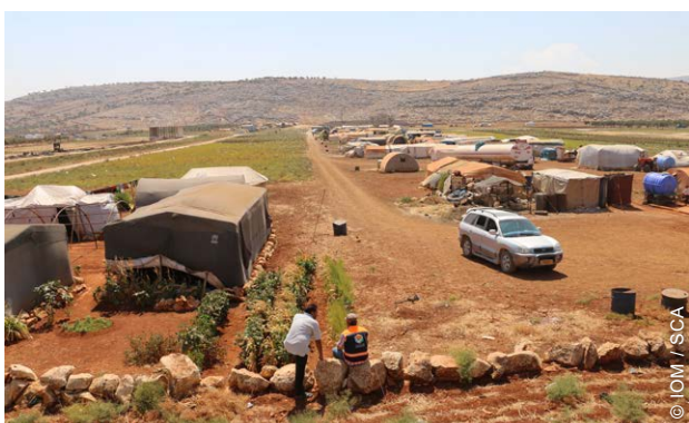
Before: An informal camp pre-flood mitigation intervention.