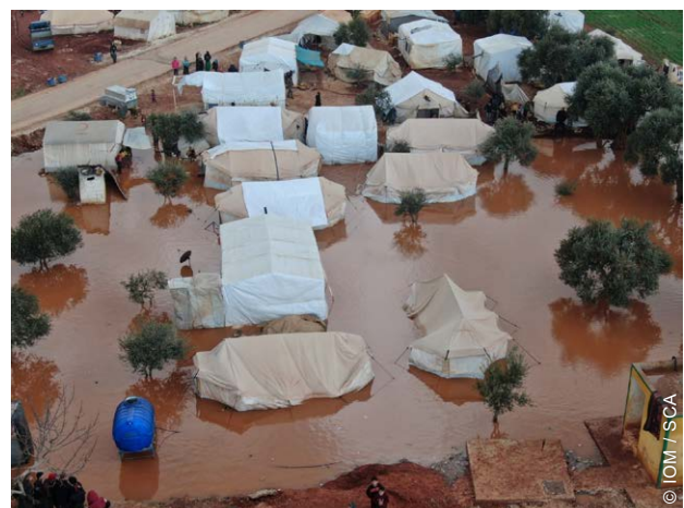
Nearly 200 IDP sites in Aleppo and Idlib Governorates reported having experienced flooding in the winter of 2018–19.

In the design phase there was some consideration of how infrastructure could be removed once the IDPs leave the sites. Plastic sheeting was placed under the drainage canals for example, to ensure that they are removable and to not harm agricultural land and soil.