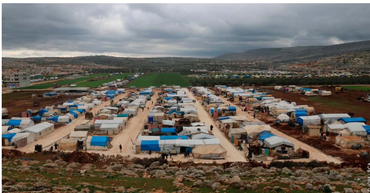
The project provided a model for how large scale infrastructure upgrades could take place across other sites in the future.

Setting a precedent. As the project was successful and resulted in a high level of resident satisfaction, it has provided a model for the S/NFI Cluster, who made site infrastructure upgrades a key priority for mid-term interventions in NWS.