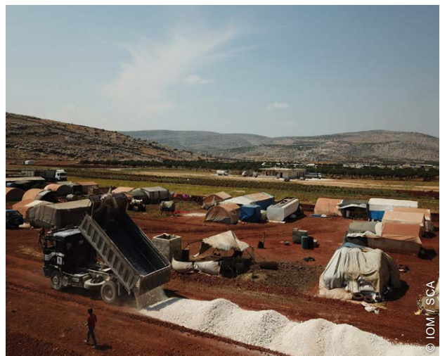
Implementing Partners coordinated with site residents to try to minimize disturbance during site works.

Following the interventions, the organization handed over to the local camp management structures, providing information on the required care and maintenance. Additionally, other humanitarian actors who have since been providing other services in the camps, have also been supporting the local camp management structures in the cleaning, care and maintenance of the infrastructure, considering the costs are very low.