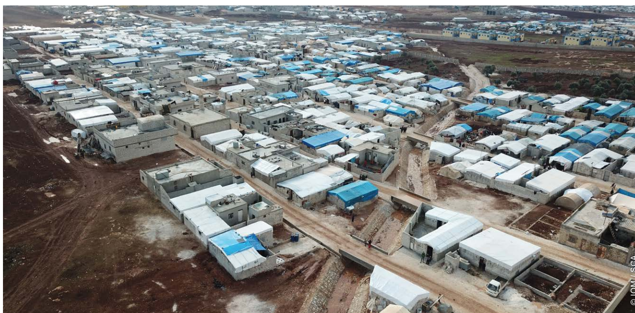
A variety of interventions were carried out based on the needs and technical assessments of each camp. These included constructing open and closed drainage systems, sewage systems, culverts, roads, and raising tents 20cm off the ground through graveling.