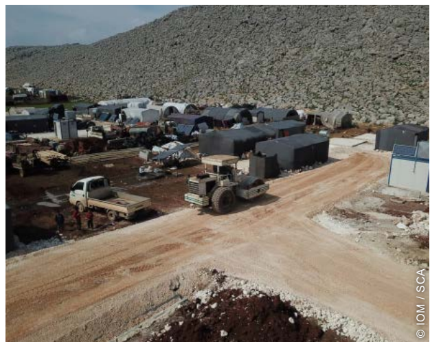
As the project was managed remotely from Gaziantep (Turkey) a range of approaches were used for remote monitoring of site works.