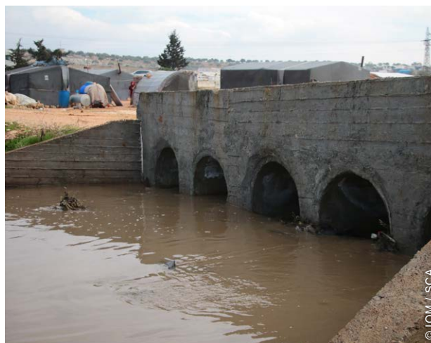
Interventions improved access and mobility for site residents within sites and also improved humanitarian actors' ability to access sites, many of which had not been able to reach during previous floods.

Impacts on local markets and livelihoods. All materials were procured locally inside Syria as they were all available. This had a positive impact on the local economy of NWS as it provided a boost to local markets and created employment opportunities for daily workers.