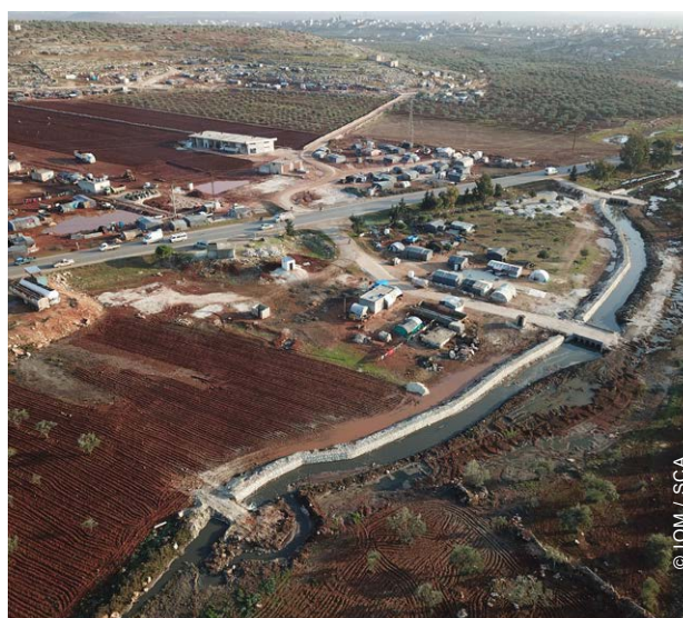
Storm drainage channels were a key site improvement intervention to mitigate the risk of flooding.

The organization triangulated documentation through community assessment checks and coordination with local authorities. In cases where HLP could not be established, technical designs were also adapted to ensure that no infrastructure was constructed on land where HLP could not be verified.