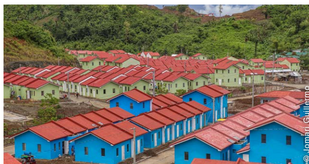
The new development, which was built for families moving from Anibong, was named DREAMville by its new residents.