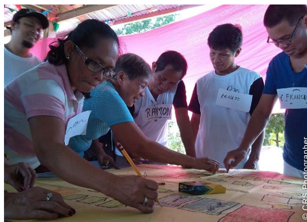
Families were engaged in meetings on settlement planning, so that they were able to help shape their new community.

To ensure a transparent selection process, the project team assisted the barangay community bodies to form Barangay Selection Committees (BSC) that were responsible for overseeing the selection process. The BSC consisted of members from the Anibong district community body, the shelter committees of the original barangays, and representatives from various groups, including youth, senior citizens, Persons with Disabilities, women, and religious groups. Based on the agreed-upon criteria, the BSC publicly posted a list of project participants for feedback from the community and validated any feedback collected to finalize the list.