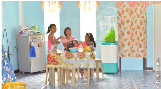
Plot matching and social network analysis ensured that the existing social fabric was maintained.