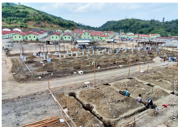
Housing construction was carried out by local contractors, with oversight and quality control from the organization's construction team.

The project aimed to take a holistic, integrated and sustainable approach, with dedicated teams supporting in relation to livelihoods, land tenure, HOA establishment and training, DRR and Social and Behavior Change Communication training, and the organization's Savings and Internal Lending mechanism.