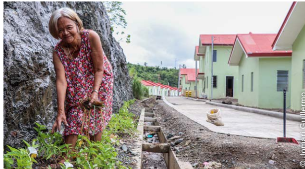
The project supported households to obtain their land title through either grants, cash payment, or loan.