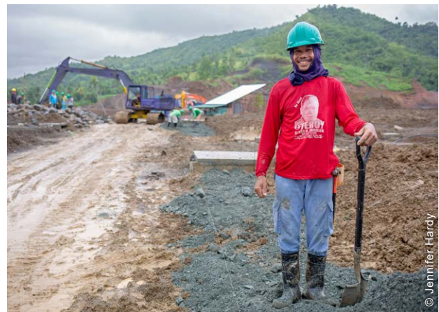
Local workers were engaged through small construction contractors for the Site Development of DREAMville and were supervised by the organization's technical team.

The establishment of the Homeowner's Association (HOA) enables the community to be resident-governed. The project provided support on land tenure, enabling all households to obtain their own land title . As a requirement of the land title process, the organization supported the families in navigating the government agencies to obtain national IDs, tax identification numbers, birth certificates, and marriage certificates. For many, this was the first time they held a nationally recognized ID and official documents which allows them to qualify for government subsidy programs .