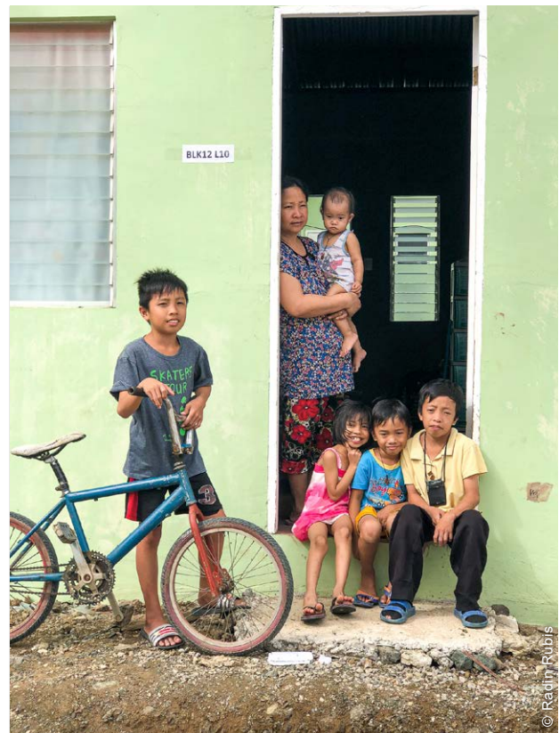
There were four main typologies of house design, with size of each family determining the size of home that they would move into.