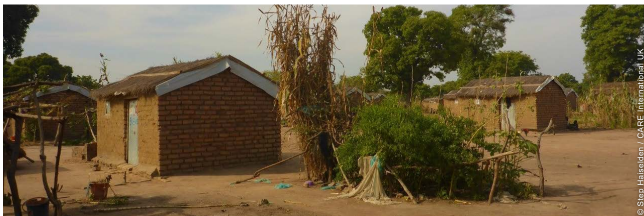
The shelter component of this project was designed as part of an integrated approach that aimed to address the three aspects of the humanitarian-development-peace nexus at a very local level. This image shows some households using the space around their shelters as kitchen gardens (Silambi refugee site, Moissala).