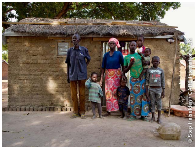
A family group outside their semi-durable shelter. All families received the same size of shelter, irrespective of their family size (Silambi refugee site, Moissala).

Implementation of the shelter component was strengthened by community engagement approaches employed as part of the wider project, such as the conflict resolution committee, GBV committee and complaints mechanism. When issues arose, they were quickly reported by individuals or the community to these community-led structures which then followed collectively agreed protocols to encourage dialogue, mitigate tensions and resolve conflict. Committees were elected by community members and were representative of the different interests and groups – for example, in terms of refugee and host population members, farmers and herders, women and men. Committees were provided with regular training on principles, dialogue and conflict resolution, and provided with the tools and materials to assist their mediation activities (such as cameras, stationery, visibility and furniture). Thus, tensions and conflict that arose over the use of host community land for refugee settlements, and the subsequent harvesting of natural resources by both refugee and host populations, were addressed through these established mechanisms, reducing the risk of inter-communal violence, fostering shared understanding, and strengthening local integration processes.