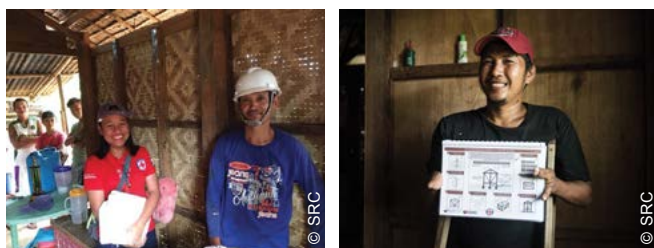
Technical support was provided to all households during construction, and on-the-job training given to project engineers.

According to the final report, all houses were structurally strengthened , with an estimated 60 per cent considered to be fully reinforced, while the remaining 40 per cent required further improvements. This was observed in larger houses, where the funds distributed were stretched more, or in houses which were partially timber and partially masonry, requiring more expensive connection techniques. However, through the orientation sessions and information materials, those households were also given knowledge about how to address these issues and how to continue strengthening their home.