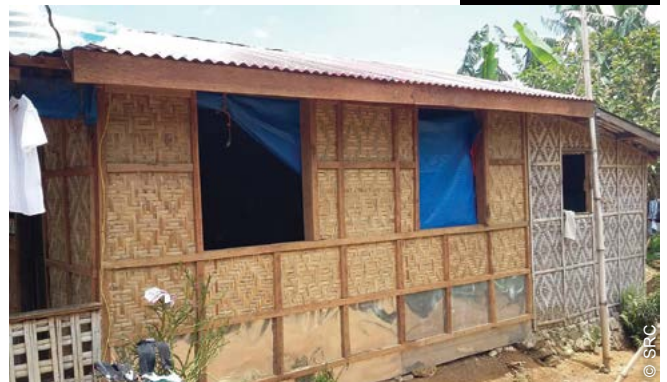
Cash was distributed in two tranches to achieve the repairs, following technical assessments of the quality of the works conducted.