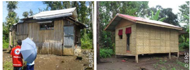
This picture shows a house before and after the intervention. All targeted shelters were structurally strengthened, with a high involvement of the affected people.