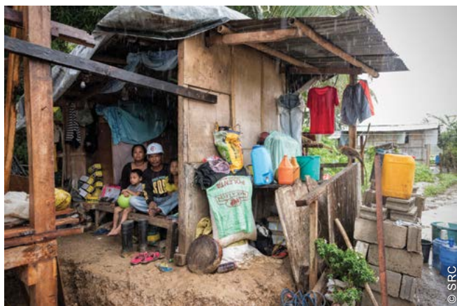
Most houses built in lightweight materials failed during the typhoon and were quickly repaired to be re-inhabited by the affected households.

Typhoon Haiyan affected most of the population in Ormoc. Most houses were constructed with light materials (i.e. timber and woven split bamboo) and the structures did not incorporate adequate bracing or other disaster-resistant construction techniques, with roofs of thatch or light corrugated galvanized iron sheets (CGIs). Houses built with concrete and masonry fared better, but most of the rest suffered varying degrees of damage. Over half of the houses were partially repaired quickly, to make them habitable (e.g. damaged roofs were covered with tarpaulins), but remained susceptible to future storms.