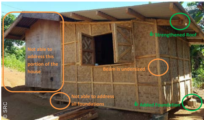
The partner evaluated all the houses repaired through the project, confirming that all had been strengthened after the intervention.