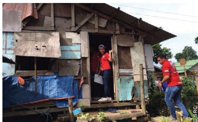
Many houses in the target areas were damaged to varying levels due to the typhoon. The project provided an option-based repair approach to upgrade all the key components of one core room of the house.