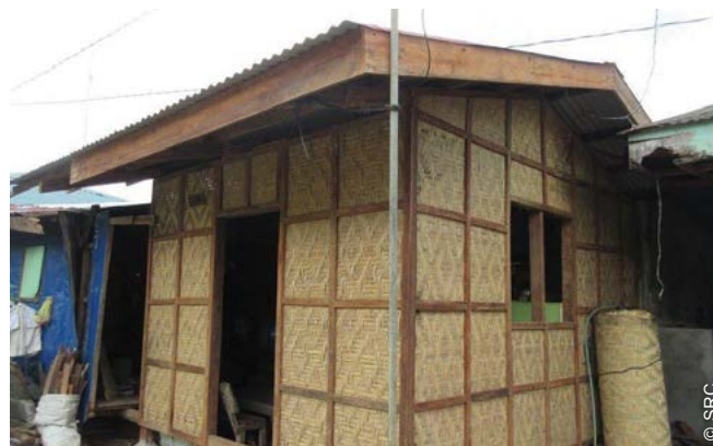
The project was cost-effective, especially if compared with core house construction.

The project trained and engaged local carpenters in the repair works. Besides the employment opportunities for the community members throughout the project, the capacity-building activities benefited beneficiaries and the wider community beyond the project. At the end of the training, trainees who passed the examination successfully received a national certificate in carpentry. For many this represented the first formal recognition of their skills. Accordingly, this training was welcome, and feedback received was overwhelmingly positive. The certification of the successful trainees increased their chances of finding better employment opportunities . Some carpenters trained in Phase 1, for instance, found jobs with better paying organizations, while others left for jobs abroad, so the implementing organization had to train more workers.