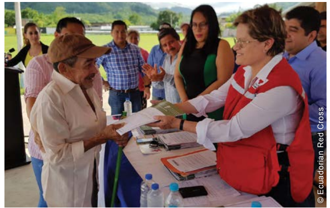
In the recovery phase, the lead organization of the HLP group provided support to families to access land titles.