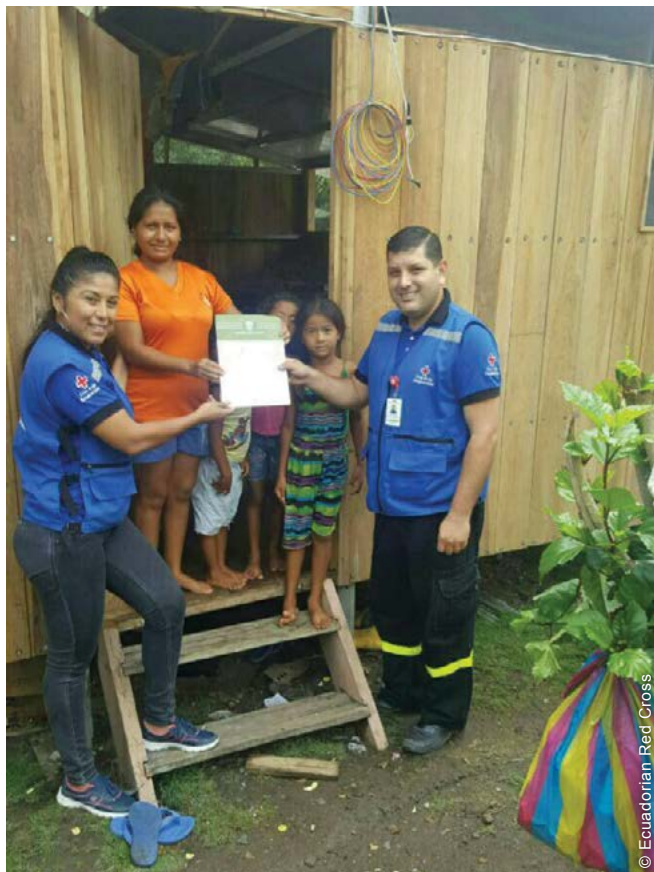
As a direct outcome of this project, 420 land titles were distributed to earthquake-affected households. Support was provided in the form of funding and technical assistance in the process of land tenure regularization.

At the time of writing, the lead organization – in partnership with a local university – was planning a new project to influence public policy around land issues after disasters. As exit activities, the organization also planned to implement HLP workshops for community leaders.