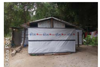
Advocacy through the Shelter Cluster helped families receiving temporary shelter support not to be disqualified from government assistance.