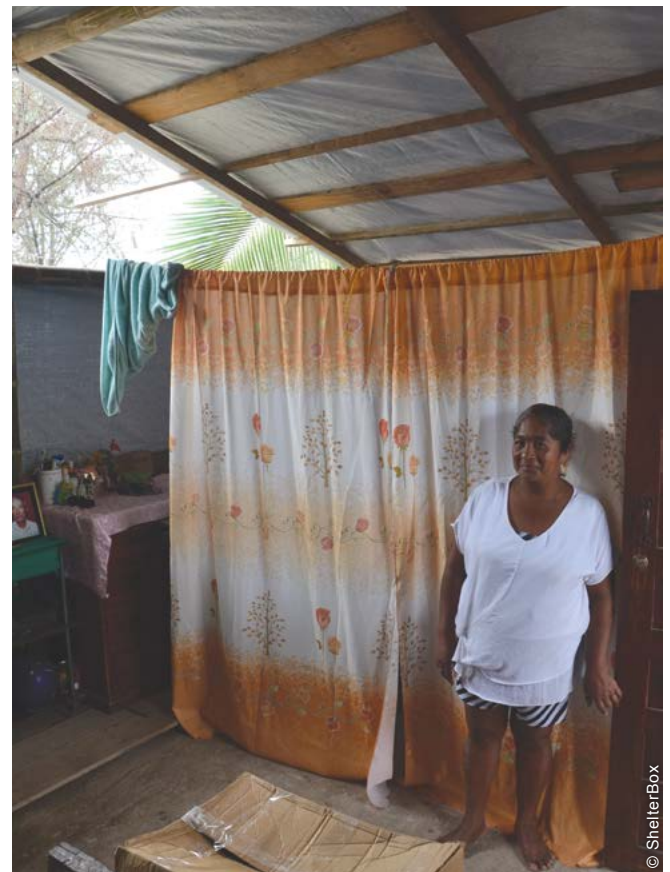
The project highlighted the need to advocate to national governments to include regulations and protections for people affected by disasters, and allow humanitarian actors to assist those without legal land titles.