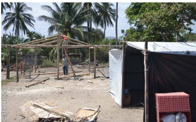
Many families in the affected areas did not have proof of land ownership. Rebuilding without legal certainty would have put them at risk.

There was a very real need to establish minimum legal evidentiary standards and mechanisms to provide security of tenure to affected communities, as well as minimum technical standards that allowed building in the affected area with sufficient legal certainty.