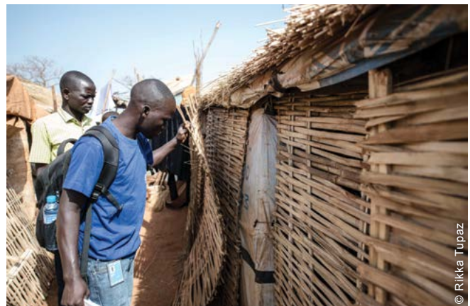
Project staff supervised the upgrades and ensured these were completed well before approving households to move on to the next phase.

The project was highly participatory and built on local capacities. Through active engagement with traditional and informal leadership structures, business leaders and women and youth groups, the project transferred expertise and knowledge to improve people's living conditions and equip the community with new skills. Allowing the community to assume increased responsibility in this process served to restore dignity and strengthen their self-sufficiency. 11 out of 15 traders engaged in the project were able to expand their business, primarily in selling a variety of items such as seeds, shoes and timber (four traders), or expanding their shelter material business (three traders). Traders also found the process of cooperating with other traders useful and beneficial and they were planning to collectively open a multi-purpose shop in the town soon.