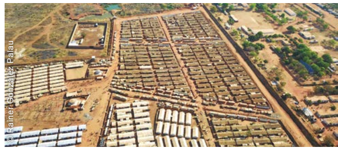
View of zone C in Wau PoC with shelters upgrades realized on 176 communal shelters between January and March 2017.