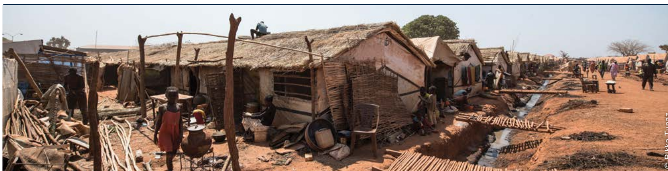
People on the site lived in communal shelters. The project upgraded the walls and roofs to extend their lifespan by protecting the plastic sheets.