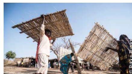
The project engaged local traders and trained beneficiaries on the upgrades, which included the addition of grass to rooftops and bamboo-thatched walls.