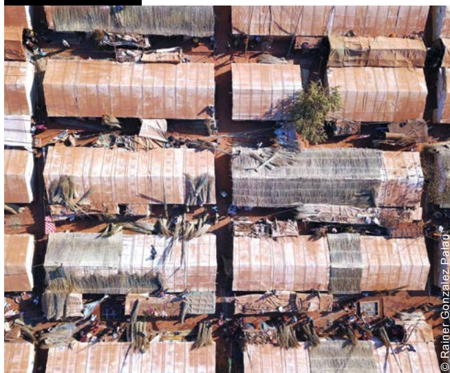
One of the upgrades consisted of adding a layer of dry elephant grass to rooftops to increase protection from the elements, improve ventilation and lower inside temperatures.