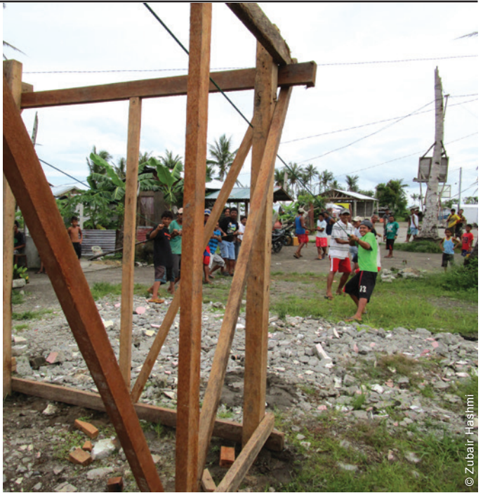
Shelter programmes which tend to prioritize structural safety over other objectives run the risk of missing or exacerbating other risks, such as loss of livelihoods, social exclusion or exploitation. Addressing structural concerns in isolation will not ensure that vulnerable people are safer than before the disaster.

For shelter practitioners in international organizations, working in natural disaster responses, there are strong pressures and incentives to build back “better” (or “smarter”, or “safer”), and subsequently, to interpret “better” as a question of structural safety 1 . This often leads to hastily agreed approaches, isolated from host government and affected populations, that define and assess “risk” in terms of structural robustness, rather than other factors relevant to people’s safety, dignity and wellbeing.