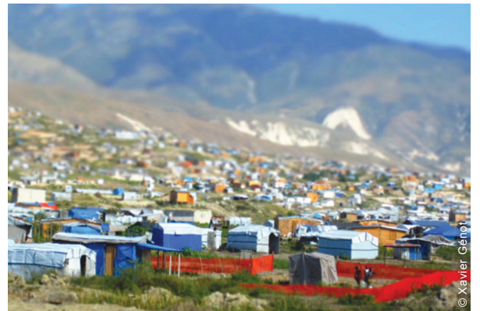
In Corail, Haiti, a camp was built to engineering standards, though largely ignoring the surrounding area. Soon, it was accompanied by a massive, unmanaged, urban expansion on the adjacent land (see A.9 in Shelter Projects 2010).

In existing debates about “duty of care” vs “informed choices”, the former is often narrowly defined to be about structural safety. It is easy to fall into the trap of thinking that, if only people have sufficient understanding of structural design, it will change their understanding and prioritization of the risks they face. Rather than prioritizing and seeking to fully control risks that lie within their professional competence (to the detriment of recognizing other risks), shelter practitioners must enable informed choice, by providing affected people with the tools and knowledge they lack. Shelter practitioners must also learn to trust the informed choices that people make, even if they do not understand or cannot relate to them.