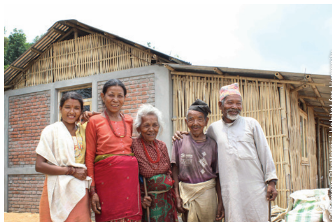
The shelter sector risks doing more harm than good, unless affected people are more involved in the decision-making process.