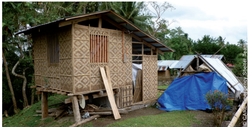
Success must be measured in outcomes for disaster-affected people, not in outputs of shelters in compliance with externally set standards.