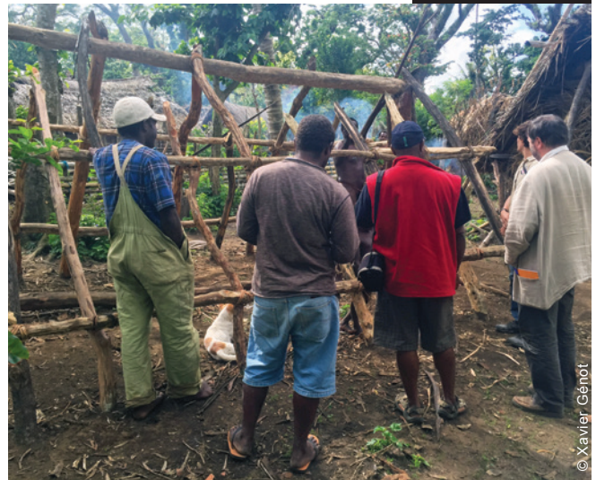
Assessments of vernacular architecture were conducted in indigenous communities (here, in Tanna).

Unsurprisingly, the buildings that suffered the most damages were those outside traditional communities – mainly in informal settlements – that were made of mixed traditional and modern materials and incompatible construction systems . After Cyclone Pam, many of these were being rebuilt the same way as before, thus recreating (when not exacerbating) the same hazard vulnerabilities, due to a lack of proper materials, building know-how and financial resources 2 .