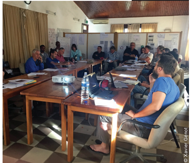
The Shelter Cluster had a Technical Working Group focusing on Build Back Safer awareness and developing a training framework with Vanuatu vocational training institutions.