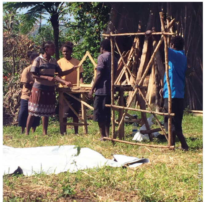
Cluster partner agencies conducted Build Back Safer shelter awareness sessions across communities, such as this one in Tanna.

In respect of the “do no harm” principle, humanitarian agencies did not build houses, but instead provided safe-shelter awareness and materials that explored ways in which modern construction can learn from, and be strengthened through, the lessons from the past. This also aimed to reactivate the fading knowledge for the new generations.