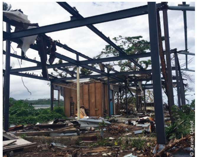
The cyclone affected public buildings as well as private ones.