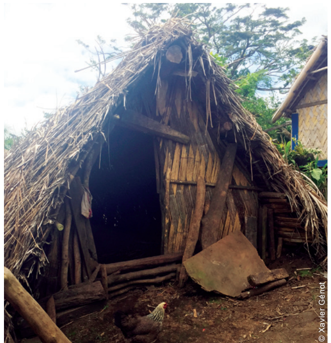
Most of the housing in Vanuatu was built according to vernacular techniques.

natural disasters , and this approach should be at the core of shelter response and preparedness. It would also help to learn from and support the reactivation of traditional knowledge, that is eroding due to a combination of factors, such as migration, urbanization and the passing away of elders.