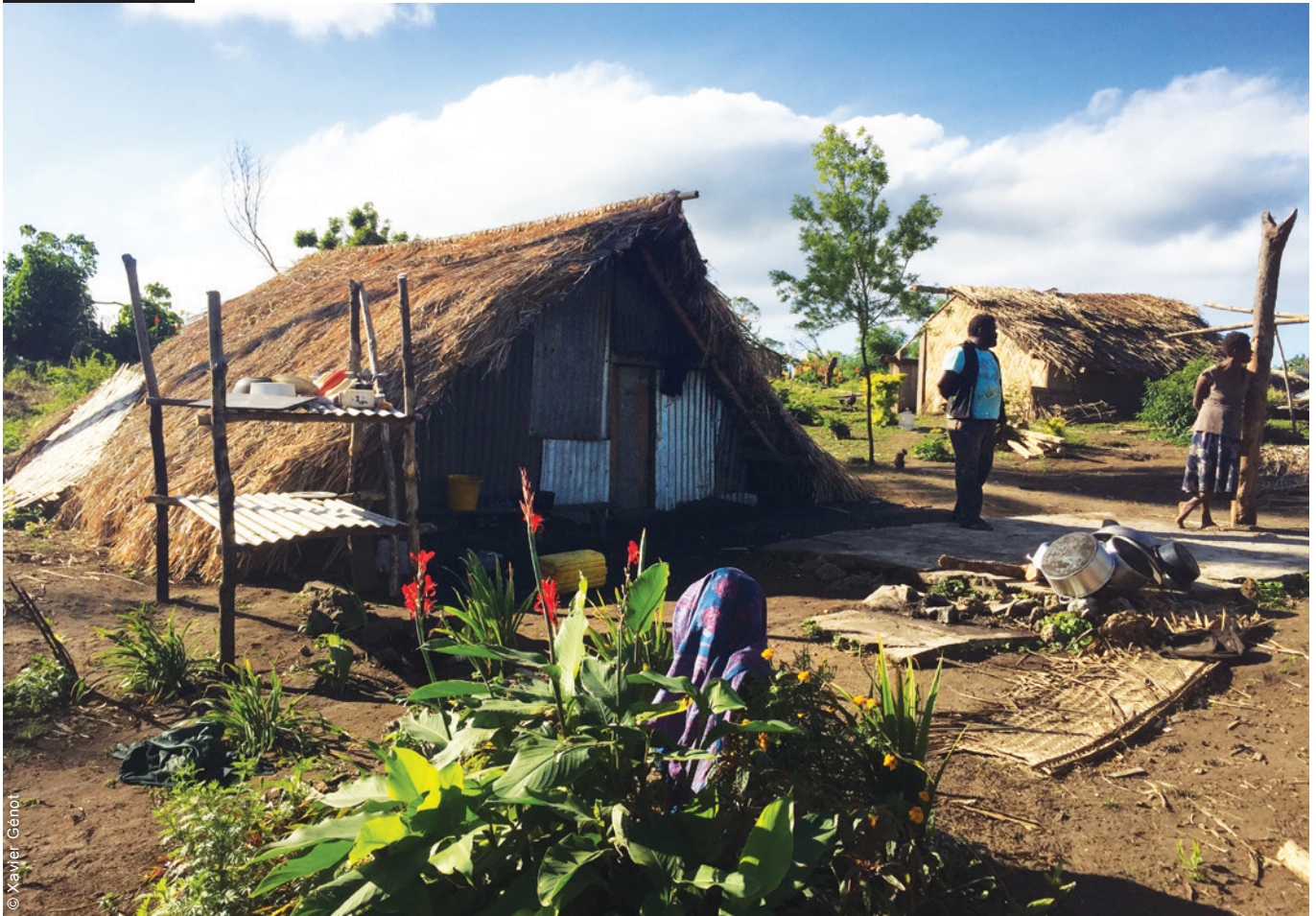
Households are composed of at least two dwellings, and include shared kitchens and communal gardens. Recovery had to take into consideration all these elements, not only one shelter.