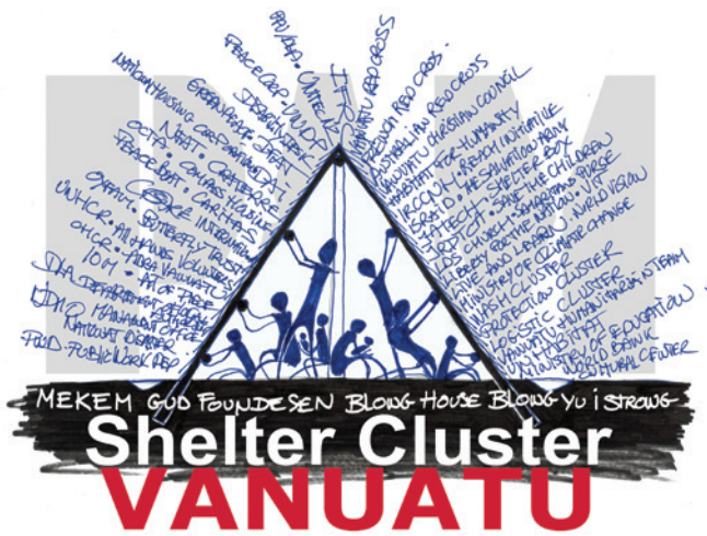
Shelter Cluster Vanuatu Cyclone Pam response branding. This illustrates the impressive resilience mechanism to cyclones and how it transfers to the response and coordination.