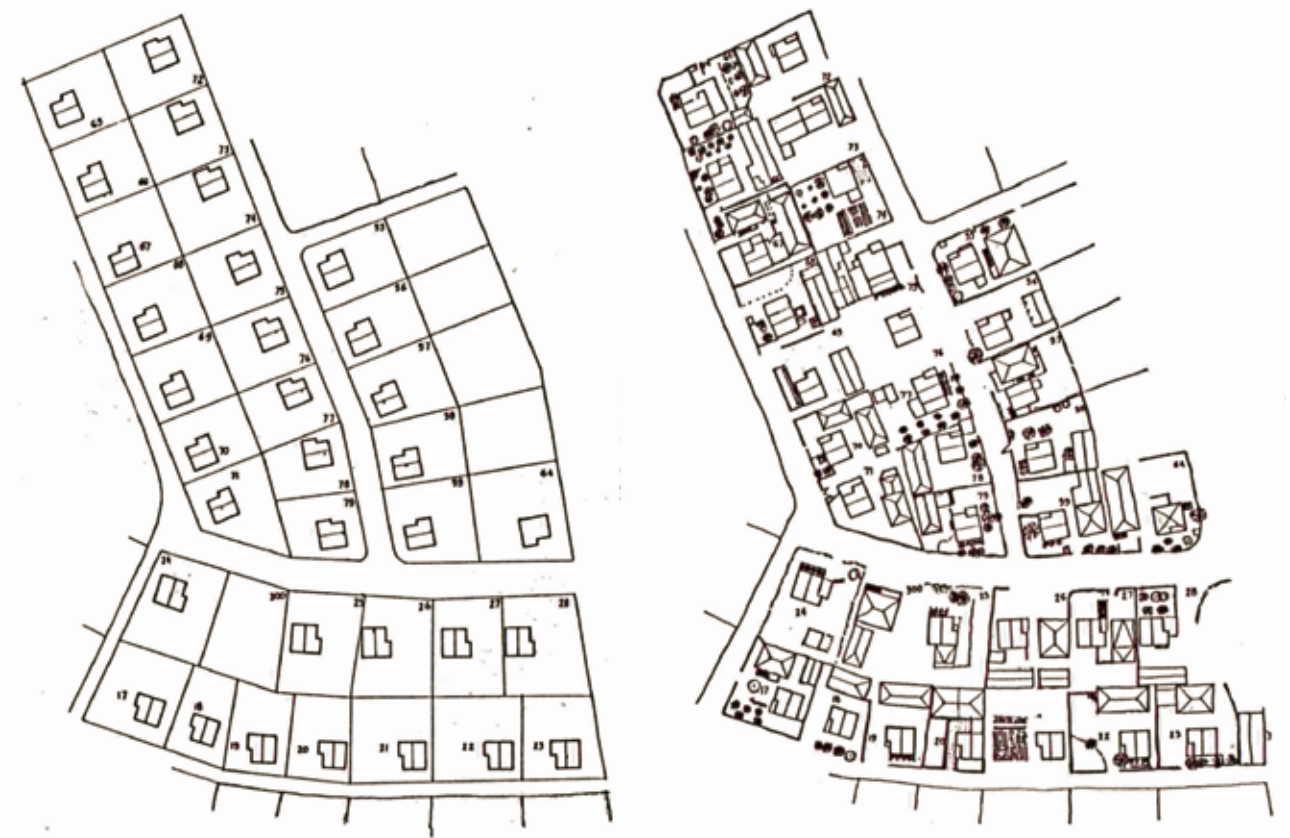
Maps of a neighbourhood of the resettlement village of new Muhipler drawn 13 years apart. Left 1971, Right 1984 Illustration: Housing and Culture after Earthquakes / Yasemin Aysan / Paul Oliver / Ian Davis