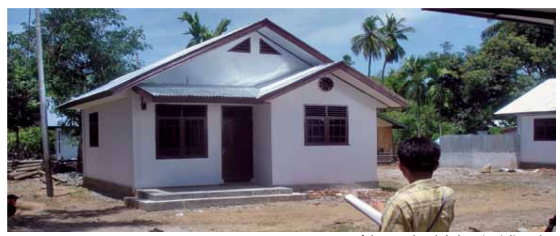
One of the completed shelters in Sigli, Aceh.

This programme began with the concept of community built 'transitional' timber framed shelters, managed and implemented by the community over a period of months. Due to challenges of procuring legal or sustainable timber, local politics, the availability of significant funds and the number of other NGOs working in the area, the project evolved into a programme building houses made from reinforced concrete and brick. The programme lasted over three years. Towards the end of the programme, many of the shelters were built by partner organisations.