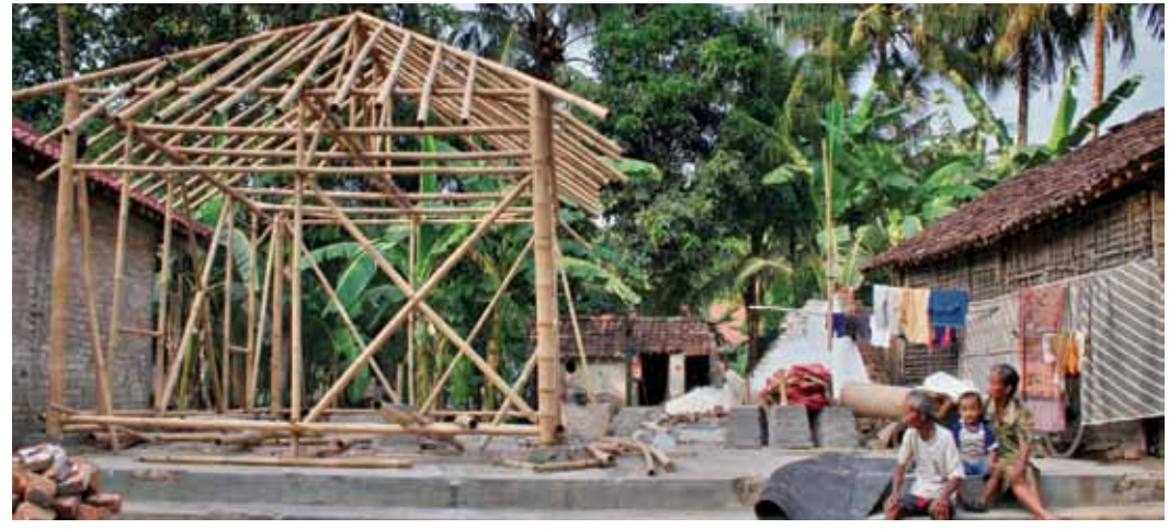
A transitional shelter built on the site of a destroyed house

This project developed a locally appropriate shelter design based on traditional building materials and construction techniques. It delivered cash with support to affected families to build their shelters. It set up a community-built transitional shelter program supported by hundreds of volunteers and provided extensive instructional and promotional materials including short training manuals, videos on CD, posters and radio adverts.