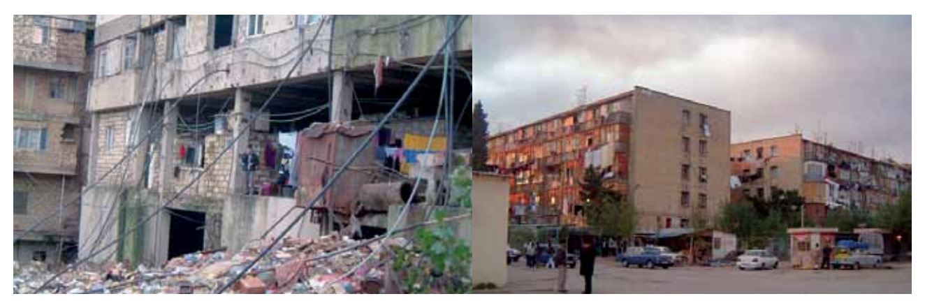
The project worked with families who had been displaced by conflict and were living in public buildings

This programme upgraded and maintained public buildings that people had moved to during the conflict in Nagorno-Karabakh in the early 1990s. The project worked with families who, by the end of the project had been displaced for over ten years. The way of working evolved over time, starting with contractor led construction, evolving into direct implementation by the NGO. Although the project closed without a clear exit strategy, aspects of the project were taken up by the government in their housing policies.