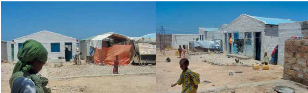
“Sites and services”. The project focused on negotiating land and providing access, secure compound walls, water supply and sanitation for it.

A resettlement project in Puntland, Somalia, preceded by detailed discussions on the concepts of access to land for IDPs and related negotiations on land rights. A consortium of agencies built a serviced community settlement supporting beneficiaries in the construction of extendable single-room houses and providing them with temporary shelters on their new plot.