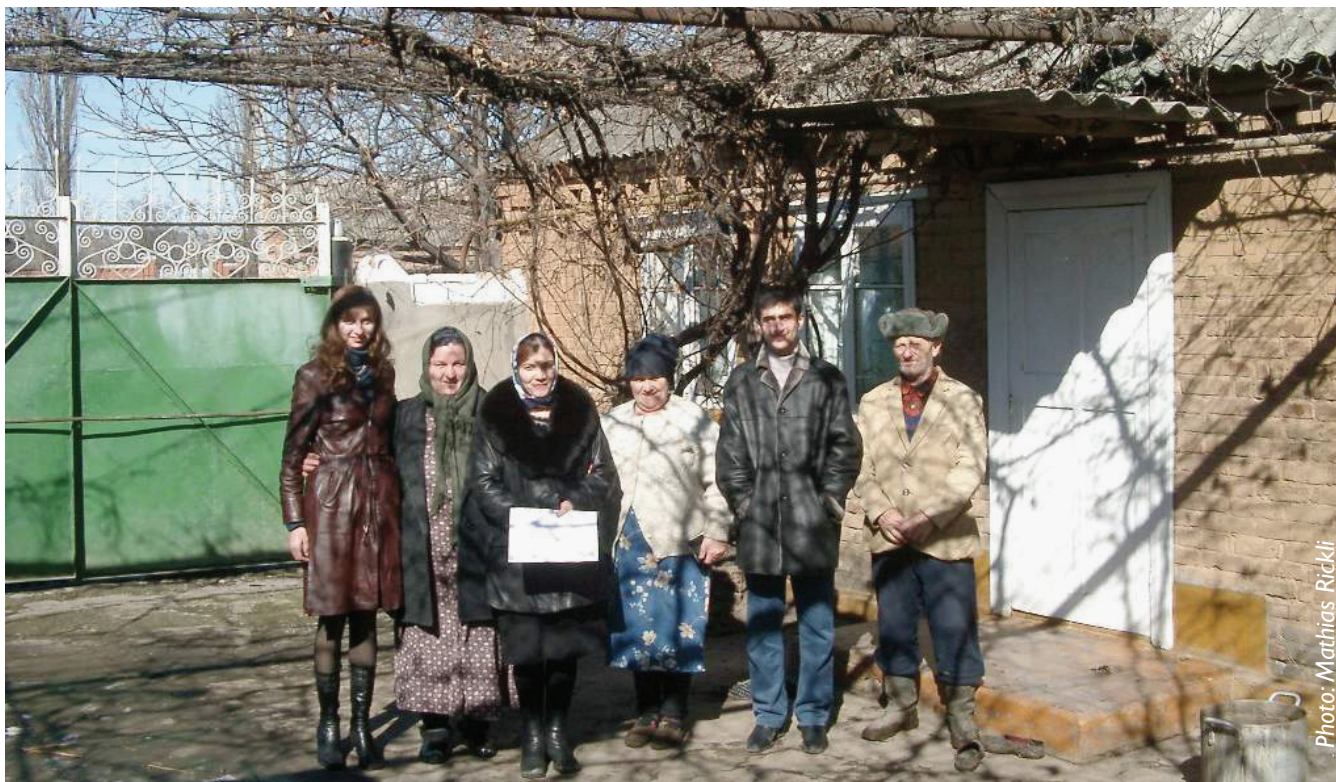
The project worked with host families.