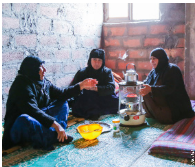
Women sitting in shelter within Tigris informal settlement