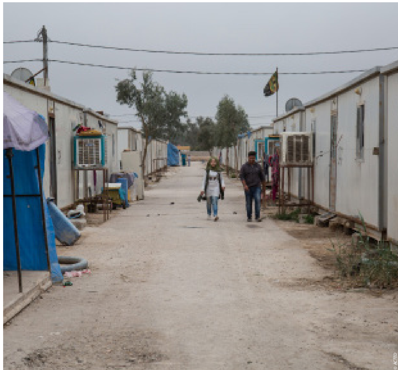
Nabi Younes camp, Iraq