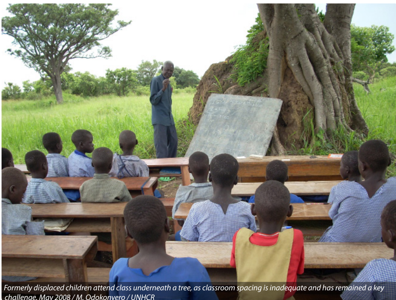
Formerly displaced children attend class underneath a tree, as classroom spacing is inadequate and has remained a key challenge. May 2008