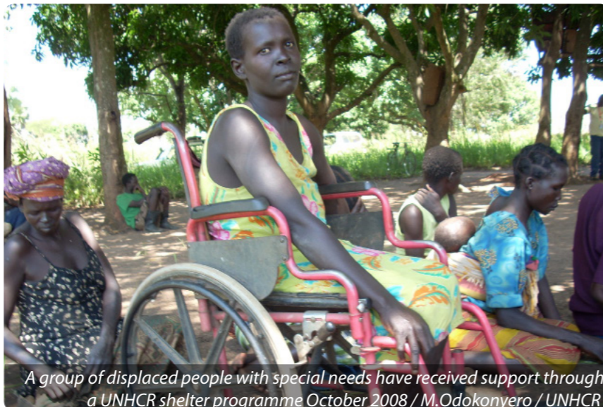
A group of displaced people with special needs have received support through a UNHCR shelter programme October 2008

scattered burial plots, and coherence of handing over infrastructure constructed by NGOs that had left.