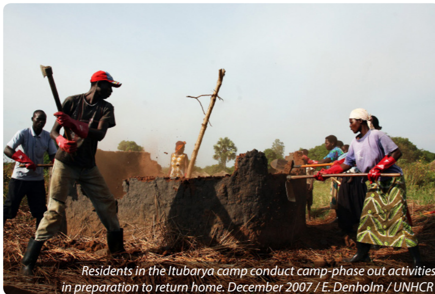
Residents in the Itubarya camp conduct camp-phase out activities in preparation to return home. December 2007

by the host community, including infrastructure rehabilitation, tree planting, and erosion mitigation.