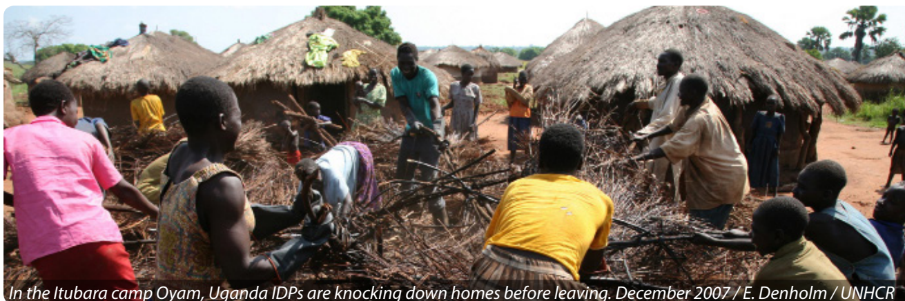
In the Itubara camp Oyam, Uganda IDPs are knocking down homes before leaving, December 2007