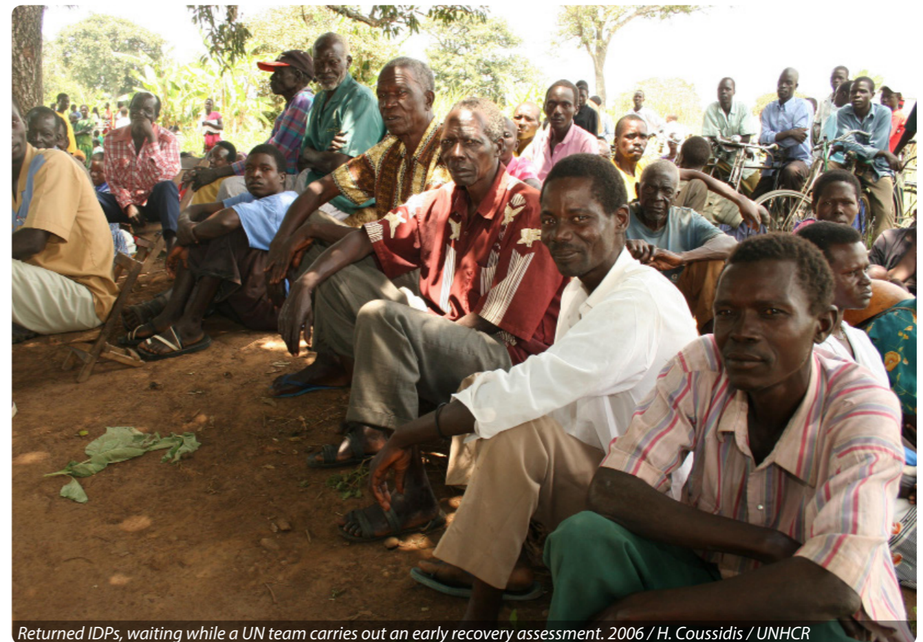
Returned IDPs, waiting while a UN team carries out an early recovery assessment. 2006 / H. Coussidis / UNHCR