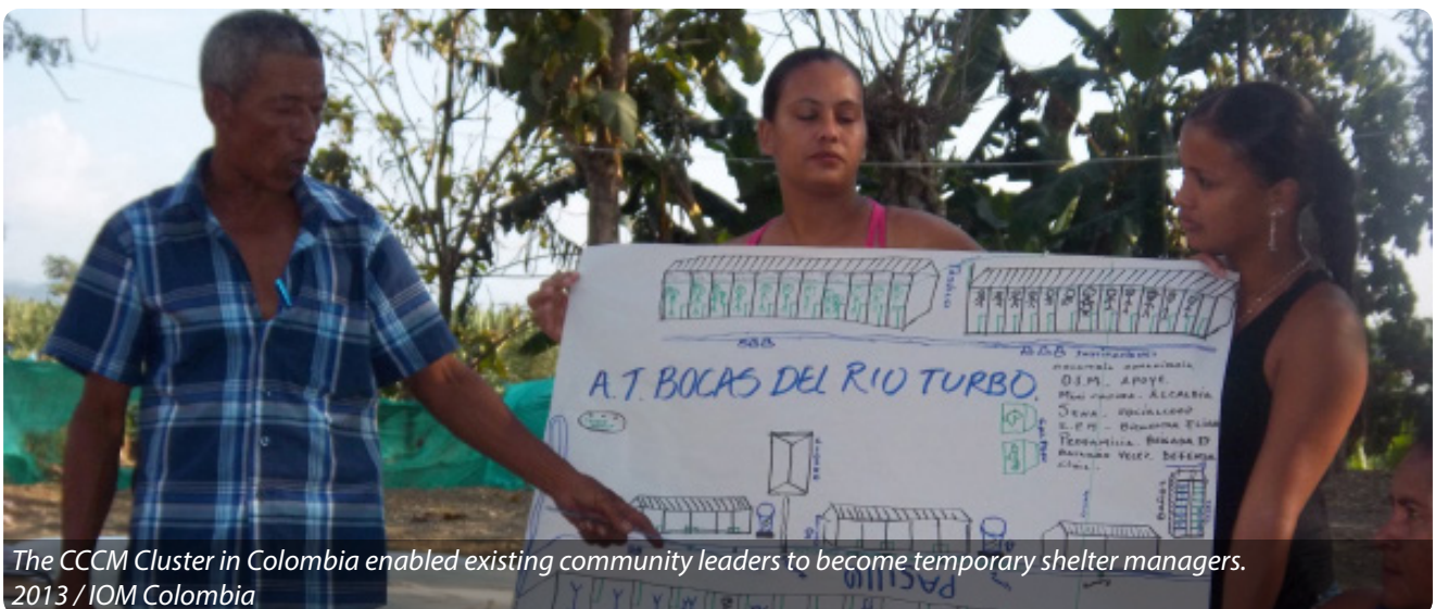
The CCCM Cluster in Colombia enabled existing community leaders to become temporary shelter managers. 2013 / IOM Colombia

CCCM Cluster: Activated (combined cluster – CCCM and Shelter)